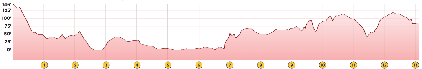
ELEVATION CHART (NOT TO SCALE)